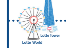
Activity 3 : Ticket