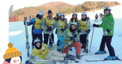
Activity 1 : Ski