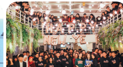
Activity 2 : Welcome Party