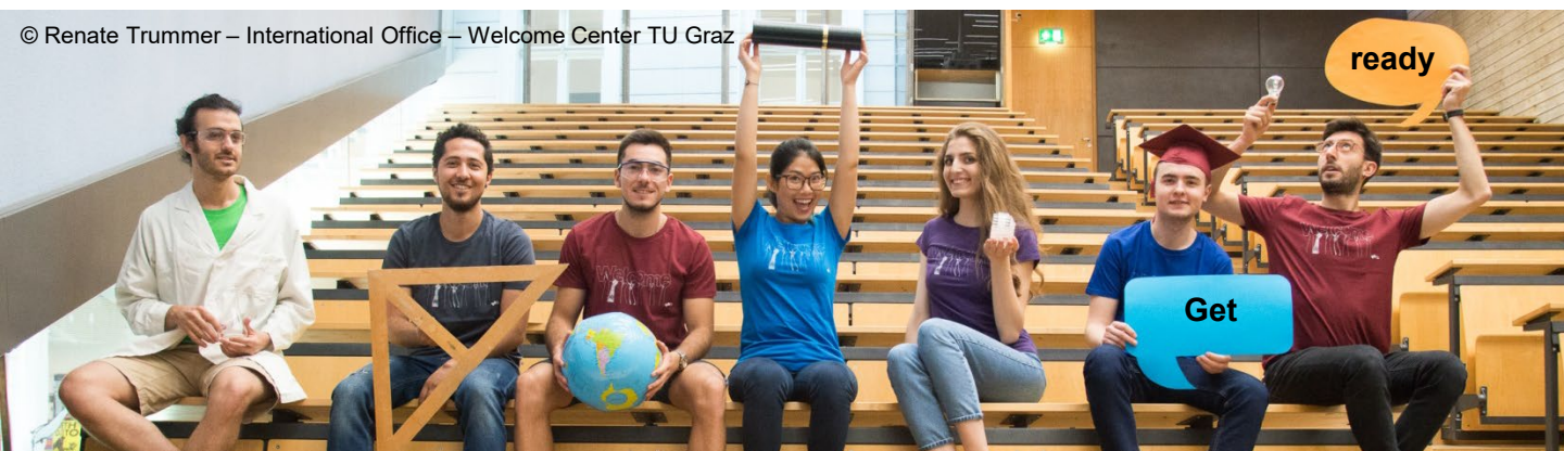
© Renate Trummer – International Office – Welcome Center TU Graz