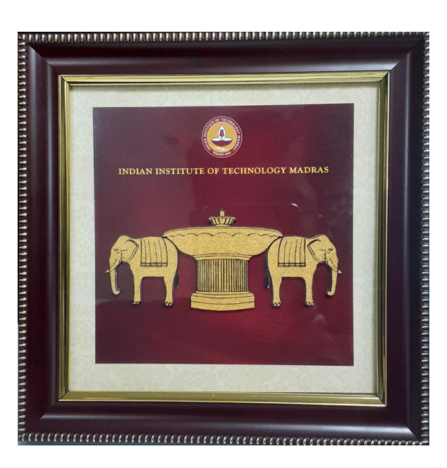
{\bf GC}\ {\bf frame} - framed memento with the imagery of IITM's Gajendra Circle